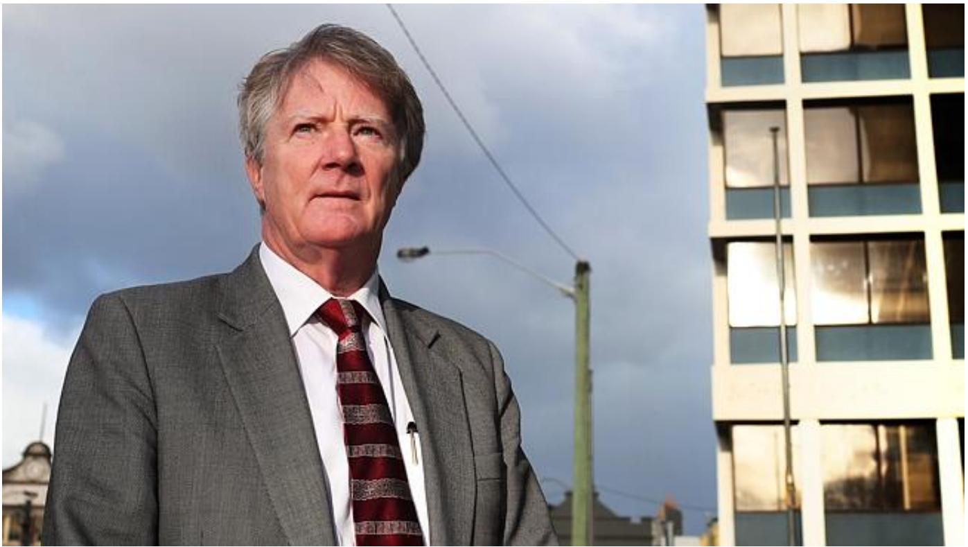
His book is about representing himself in court for more than 10 years and 250 appearances while battling a fraudster.